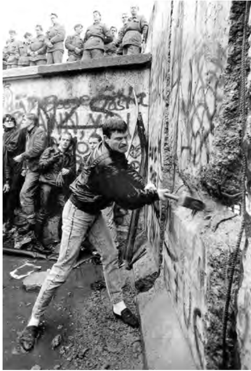
A photograph of events at the Berlin Wall in November 1989.