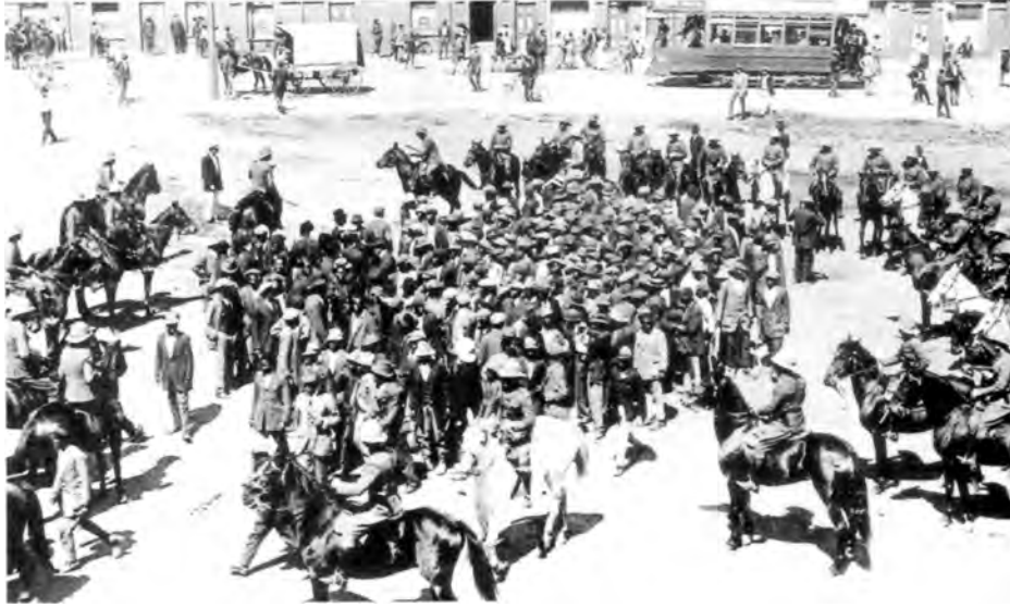
Anti-pass demonstrators being arrested in Johannesburg, 1919.

17 Study the photograph, and then answer the questions which follow.