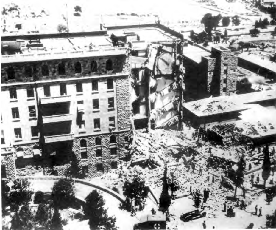
The King David Hotel in Jerusalem following a terrorist attack, 1946.

20 Study the photograph, and then answer the questions which follow.