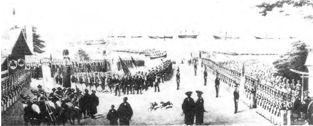
The Americans arrive to sign the Treaty of Kanagawa, 1854.