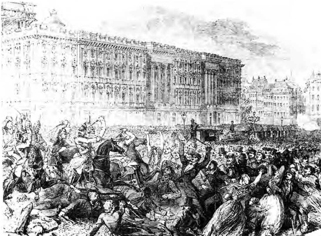
A picture showing the Prussian cavalry charging rioters in front of the Royal Palace in Berlin in 1848.