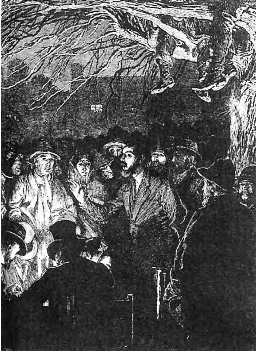
Joseph Arch speaking to members of the National Agricultural Labourers' Union in the 1870s. The meeting was held at night for fear of victimisation by landowners.

23 Study the illustration, and then answer the questions which follow.