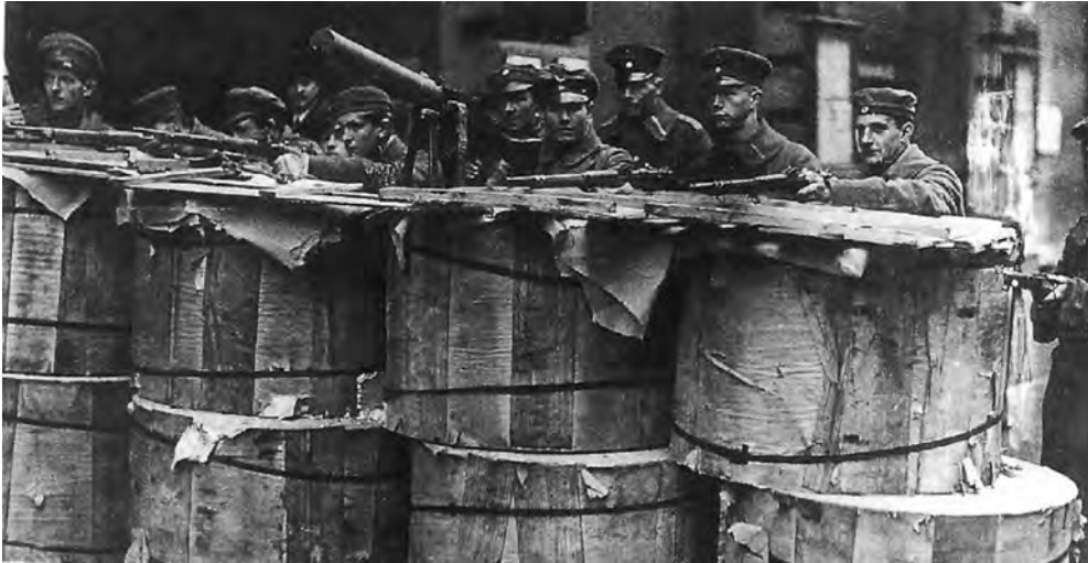
Spartacists defending the captured newspaper offices, 1919.