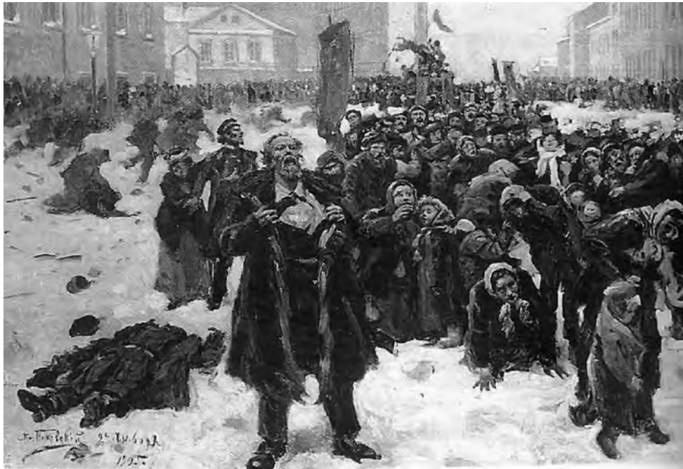
A painting of Bloody Sunday, produced around 1910.

11 Study the painting, and then answer the questions which follow.