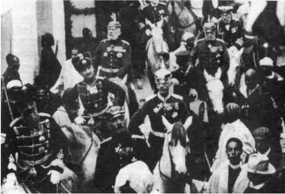
Kaiser Wilhelm II riding through Tangier in 1905.