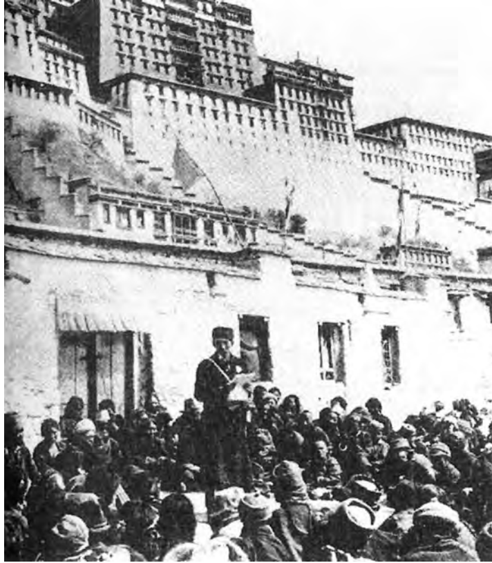
A Chinese Communist leader reads a proclamation to crowds of Tibetans in 1959.

15 Study the picture, and then answer the questions which follow.