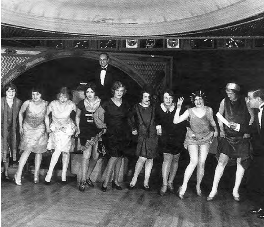
Flappers in the 1920s.

13 Study the photograph, and then answer the questions which follow.