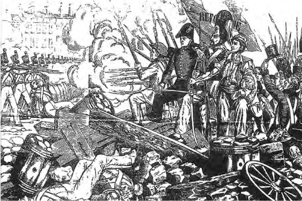
An artist's impression of the barricades constructed by the revolutionaries in France in February 1848.