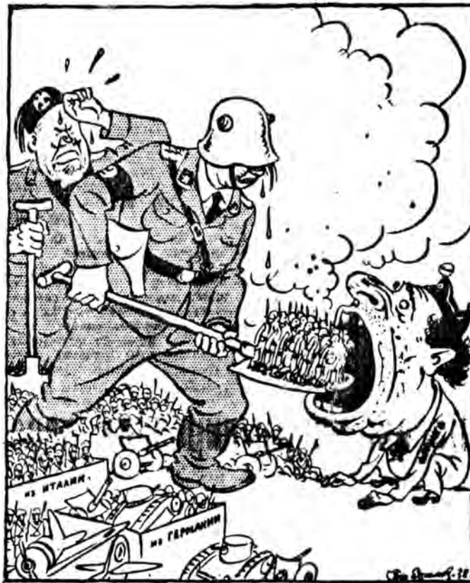
Рис. Бор. Ефимова.