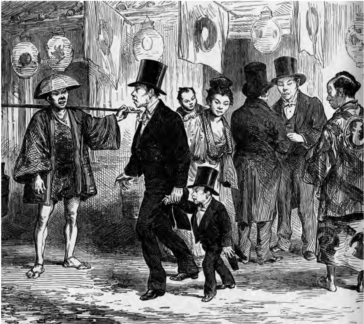
A cartoon of a street scene in Japan towards the end of the nineteenth century. It was published in a British magazine at the time.