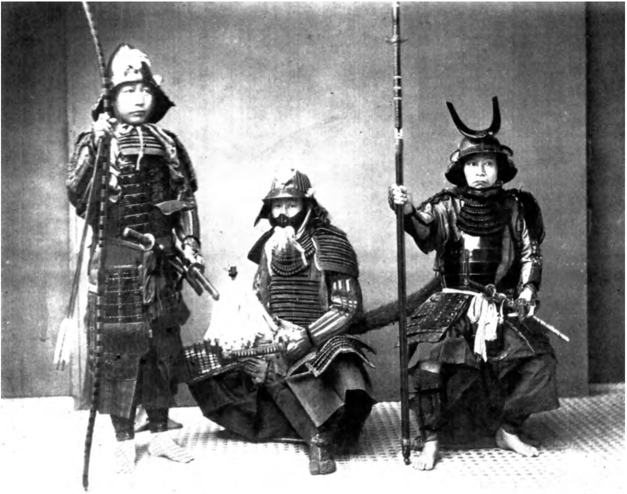
A photograph of Samurai in the 1890s.