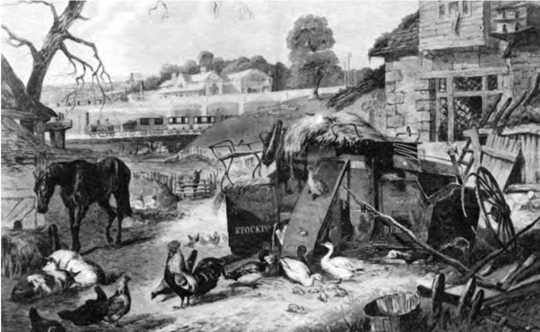
A painting of 1850 called 'Past and Present Through Victorian Eyes'.