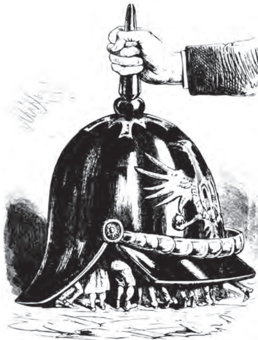
A cartoon published shortly after the Austro-Prussian War in 1866. The helmet represents Prussia while the people represent Germany.