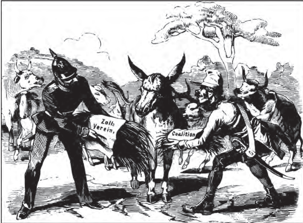
A cartoon from a German magazine published in 1852. The man on the left represents Prussia while the man on the right represents Austria. The animals represent those German states that did not belong to the Zollverein.