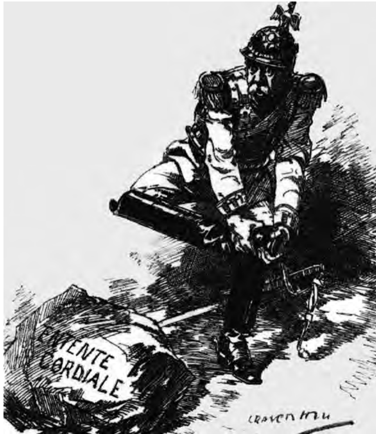
A British cartoon published in August 1911. The figure representing Germany is saying 'It's rock. I thought it was going to be paper.'