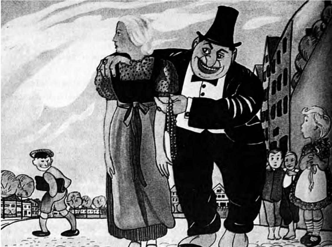
An illustration from a Nazi book to be used in schools.

10 Study the illustration, and then answer the questions which follow.