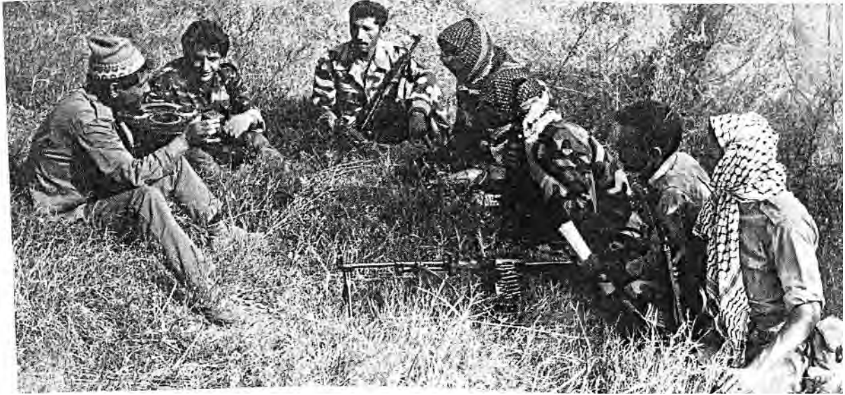
Fedayeen members before an operation against enemy units.

20 Study the photograph, and then answer the questions which follow.