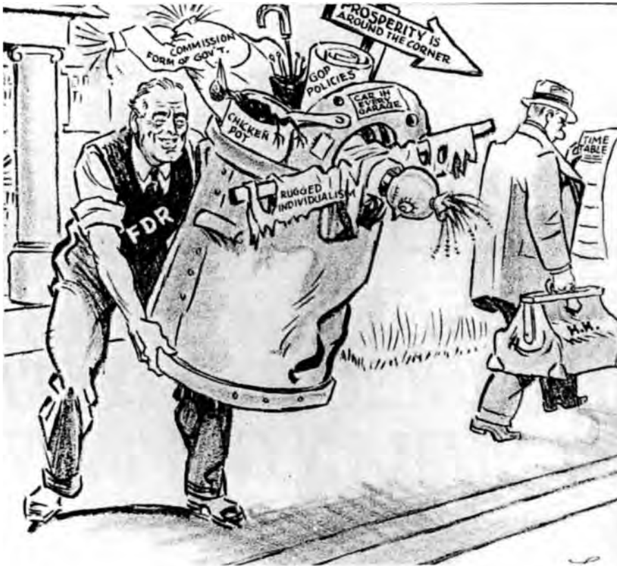
A cartoon about Roosevelt's New Deal.

14 Study the cartoon, and then answer the questions which follow.