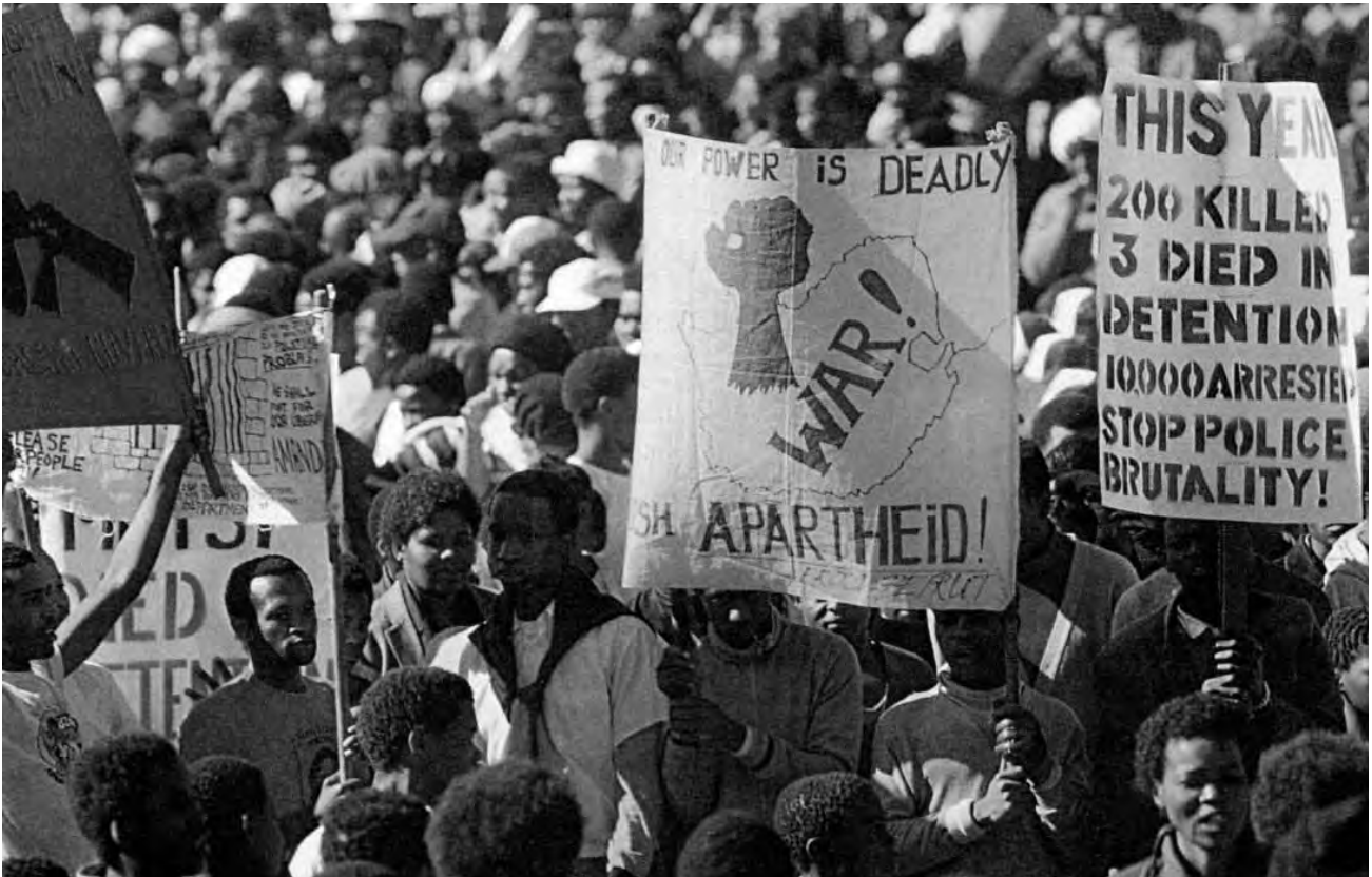
A protest in South Africa in 1986.

18 Study the photograph, and then answer the questions which follow.