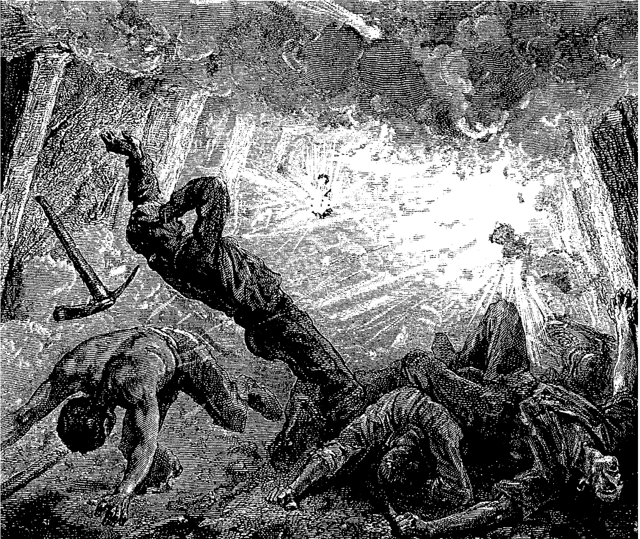
An artist's impression of an explosion in a coalmine.

22 Study the illustration, and then answer the questions which follow.