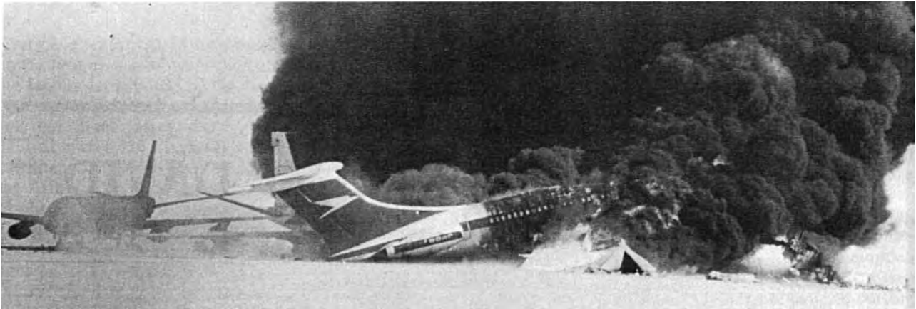
Dawson's Field, Jordan in September 1970.

21 Study the photograph, and then answer the questions which follow.