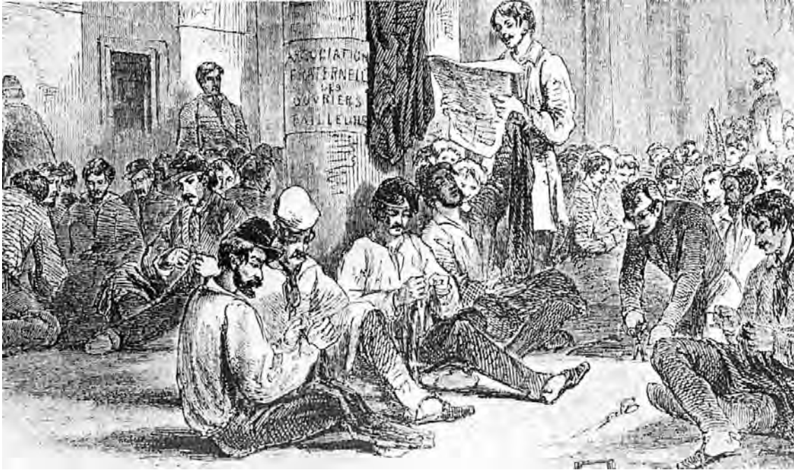
The National Workshops, Paris 1848.