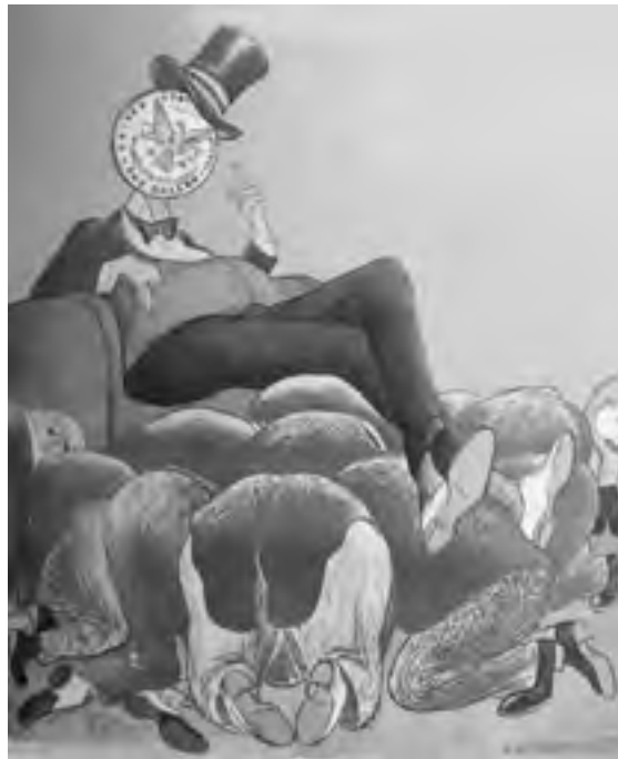
A Soviet cartoon published in 1947. The figures kneeling represent the European countries. They are kneeling in front of the US dollar.