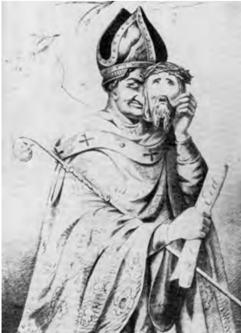
A cartoon drawing of Pope Pius IX from 1852.