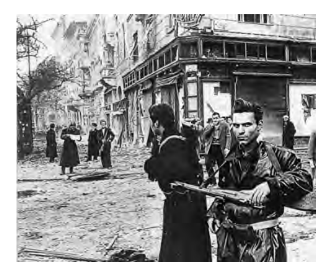
Hungarian rebels in Budapest, November 1956.

8 Study the photograph, and then answer the questions which follow.