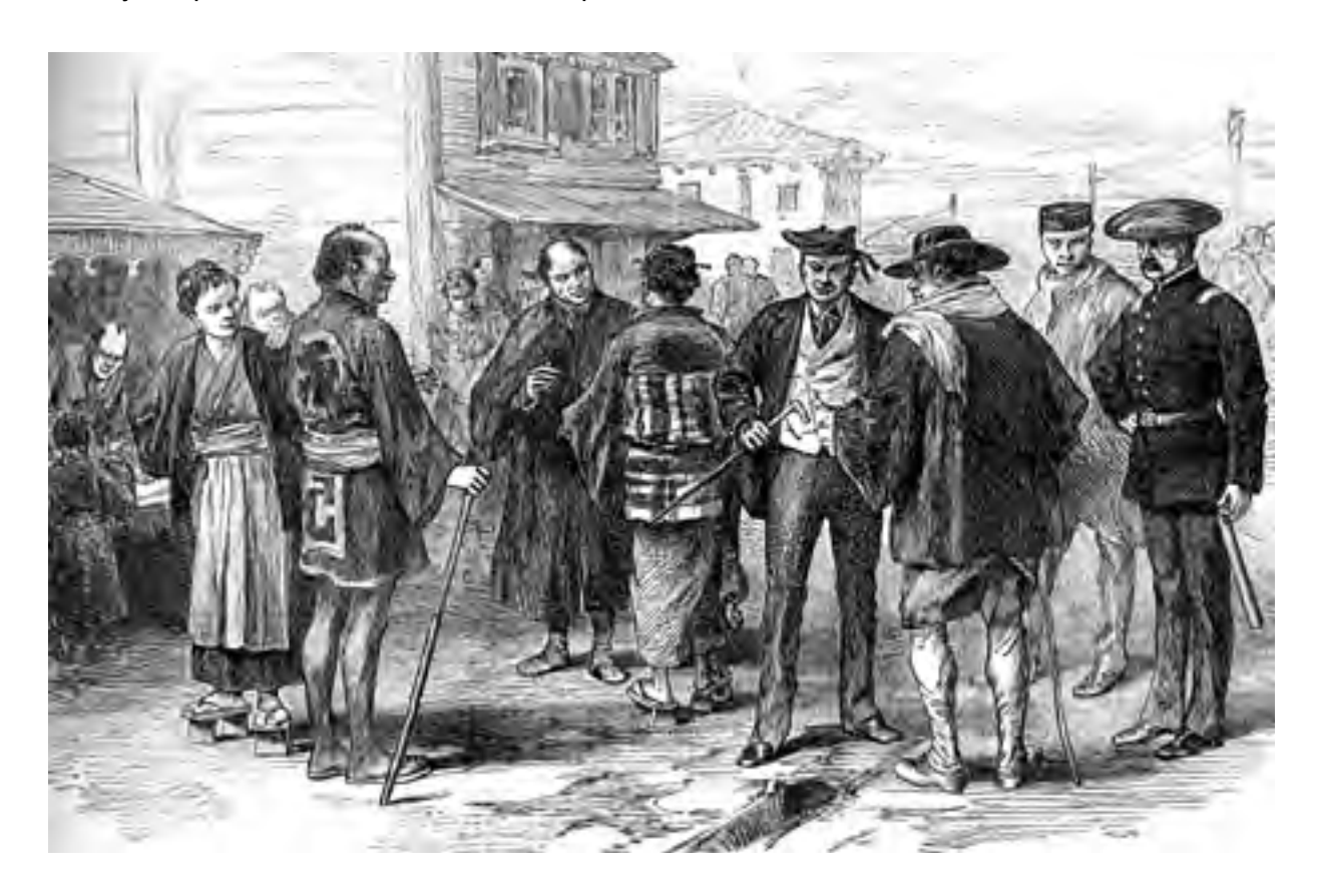
Traditional and western costume in Japan, 1873.