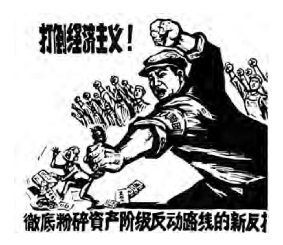
The Red Guards dealing with opponents during the Cultural Revolution.

16 Study the cartoon, and then answer the questions which follow.