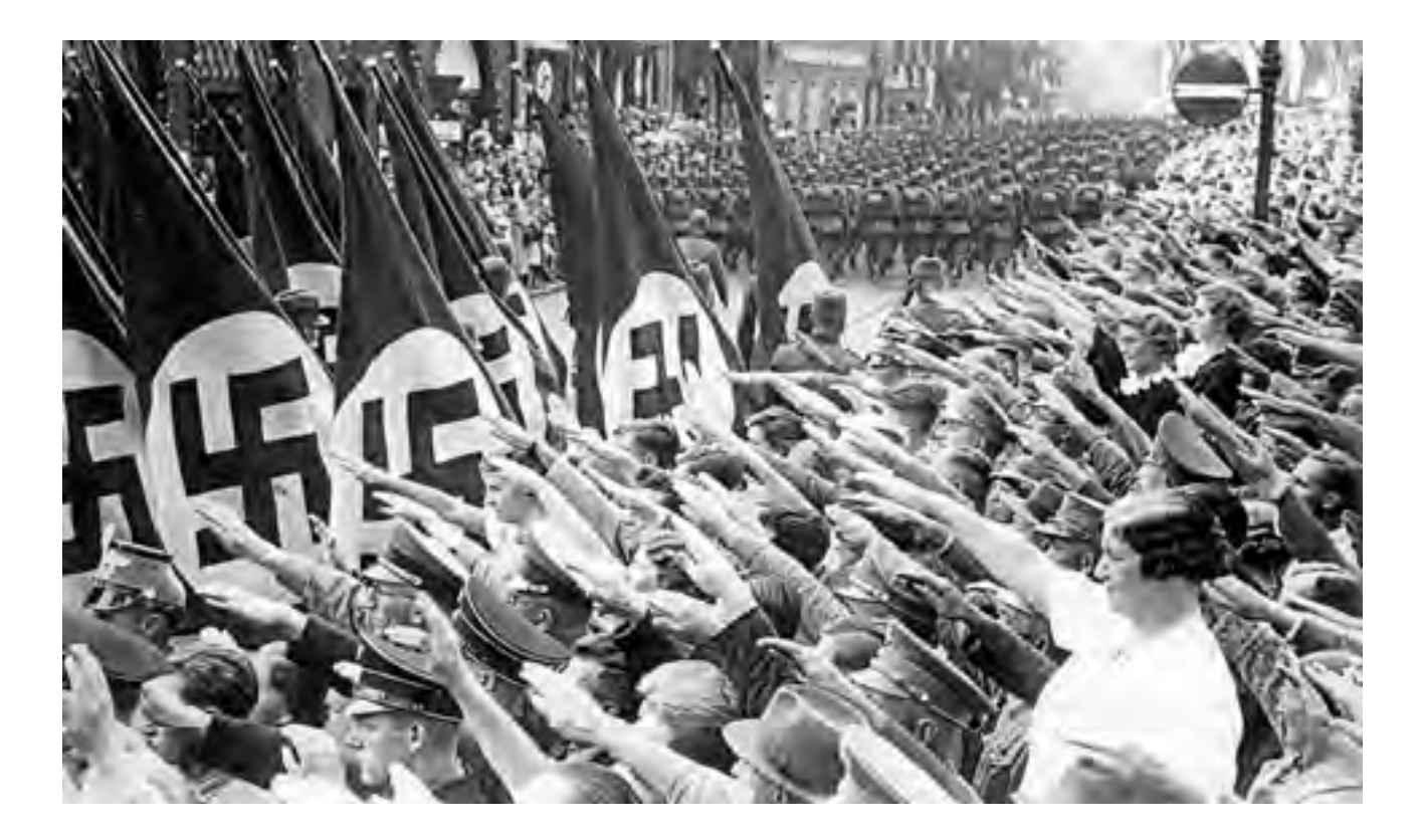
Crowds at the 1936 Nazi Party rally in Nuremberg.

10 Study the picture, and then answer the questions which follow.