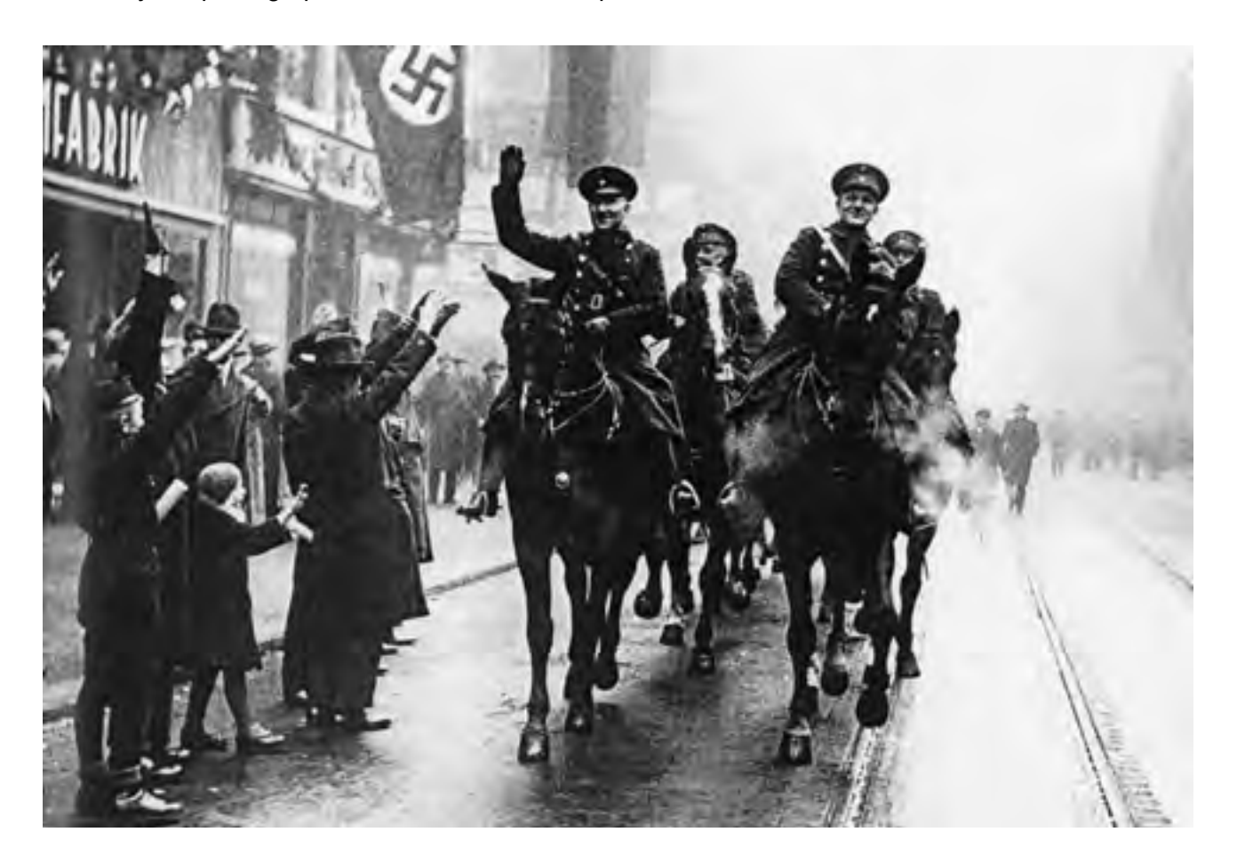
People in the Saar celebrating the results of the 1935 plebiscite.

6 Study the photograph, and then answer the questions which follow.