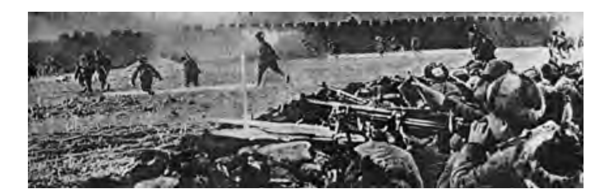
A photograph of Communist troops advancing in the Civil War.

15 Study the photograph, and then answer the questions which follow.