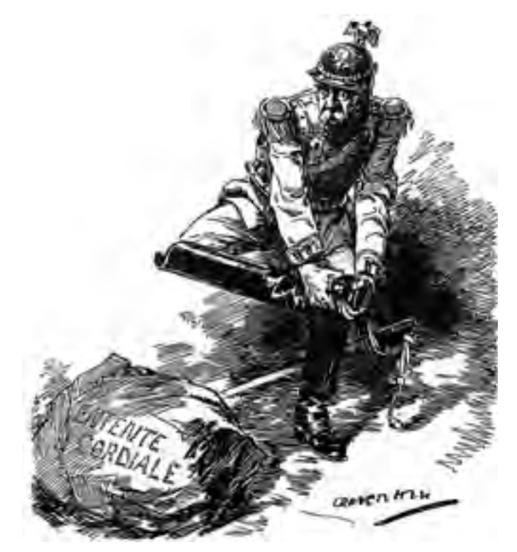
GERMANY: It's rock. I thought it was going to be paper.

4 Look at the cartoon, and then answer the questions which follow.