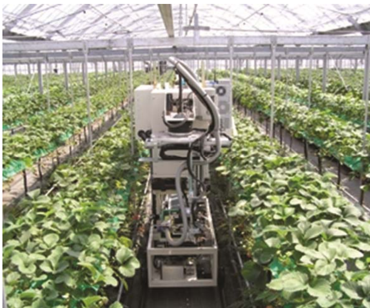
For use with Question 5 Figure 15b Foundation Tier Figure 13b Higher Tier