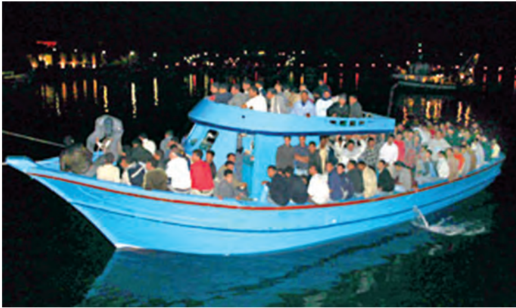
A group of refugees arriving in Italy after being rescued by an Italian fishing boat

The captain of an Italian fishing vessel is to be given a medal for rescuing 27 refugees from Somalia. The same captain had rescued 57 in November 2007. Three of the refugees drowned when their boat capsized.