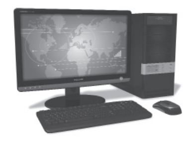
¿en tu ordenador?