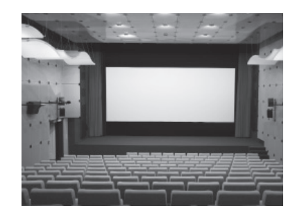
¿en el cine?

Cada vez más jóvenes prefieren ver películas online o descargarlas gratis