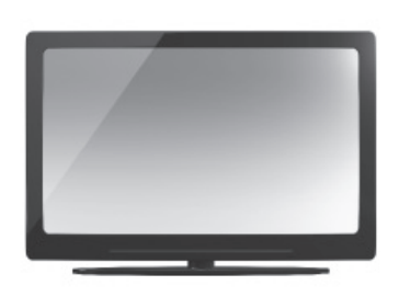
¿en la tele con DVD?

Cada vez más jóvenes prefieren ver películas online o descargarlas gratis