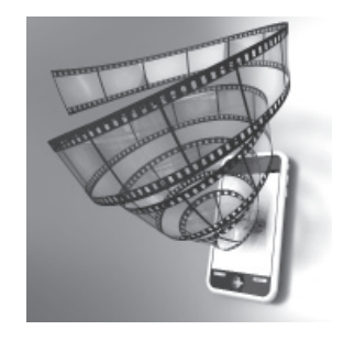
¿en tu móvil?