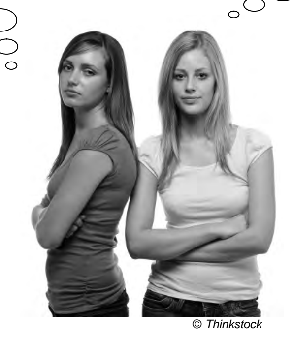
¿El motivo más frecuente de las disputas entre amigas?

No le gusta que yo tenga novio y ella no