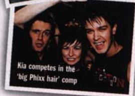
Kia competes in the 'big Phixx hair' comp