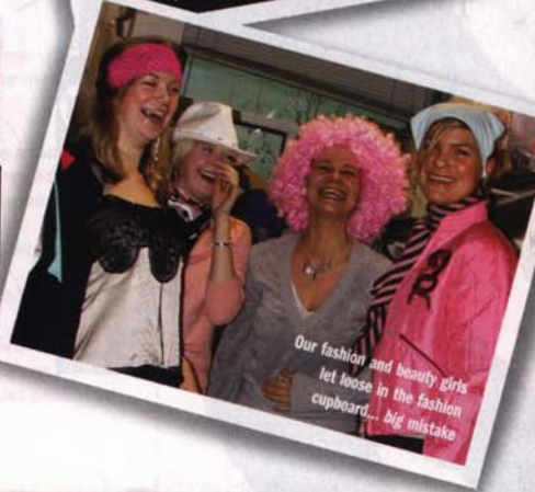
Our fashion and beauty girls let loose in the fashion cupboard... big mistake