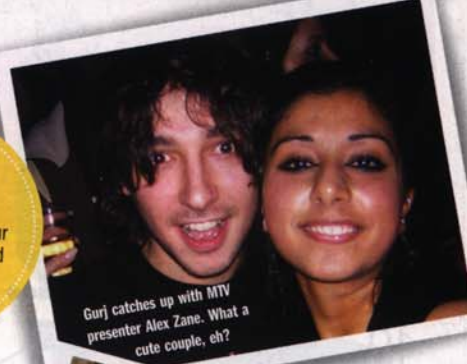
Gurj catches up with MTV presenter Alex Zane. What a cute couple, eh?