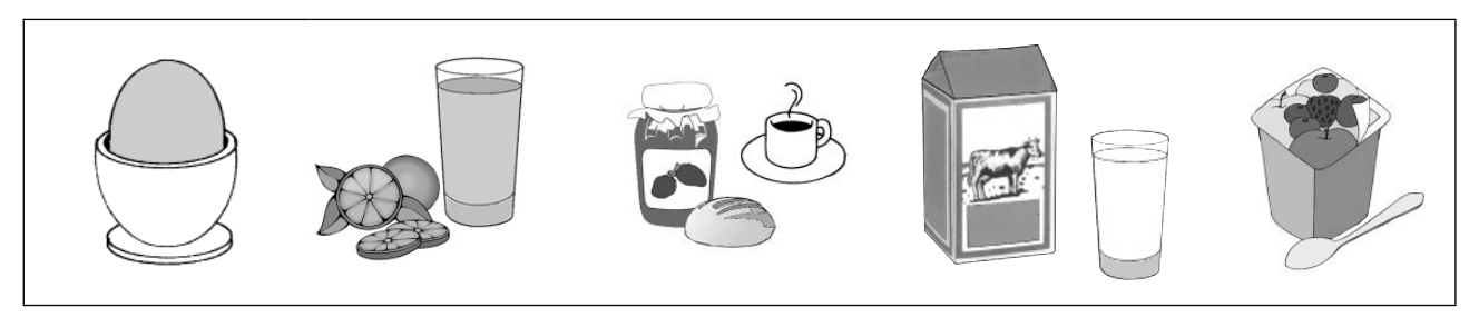
für Energie, Konzentration und Leistungsfähigkeit während des Schul- oder Arbeitstages