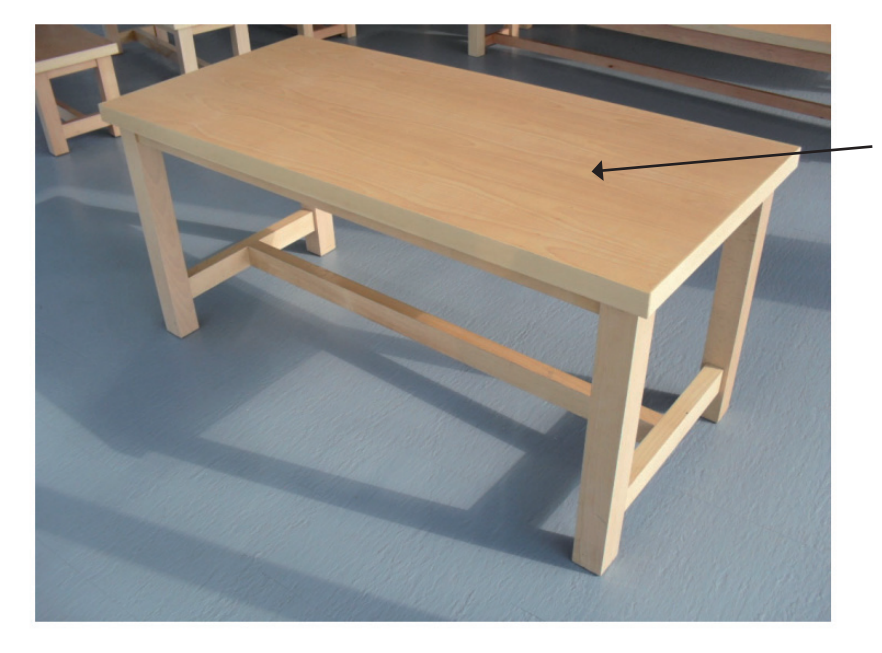
Figure 1 School dining table To be used when answering Question 7

Part A MDF table top covered with a laminate