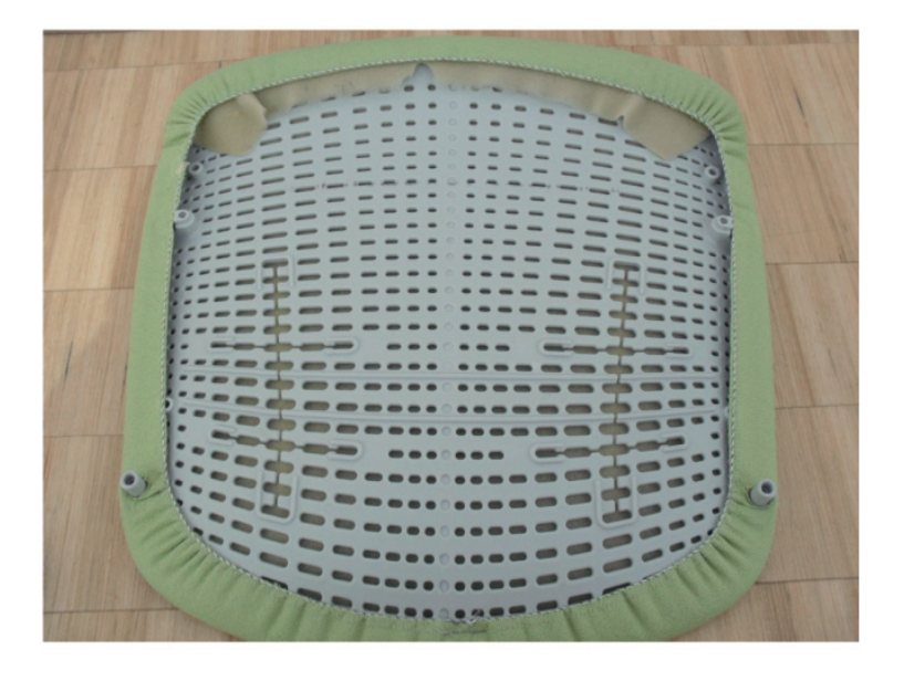
Figure 4 Underside of detached seat pad