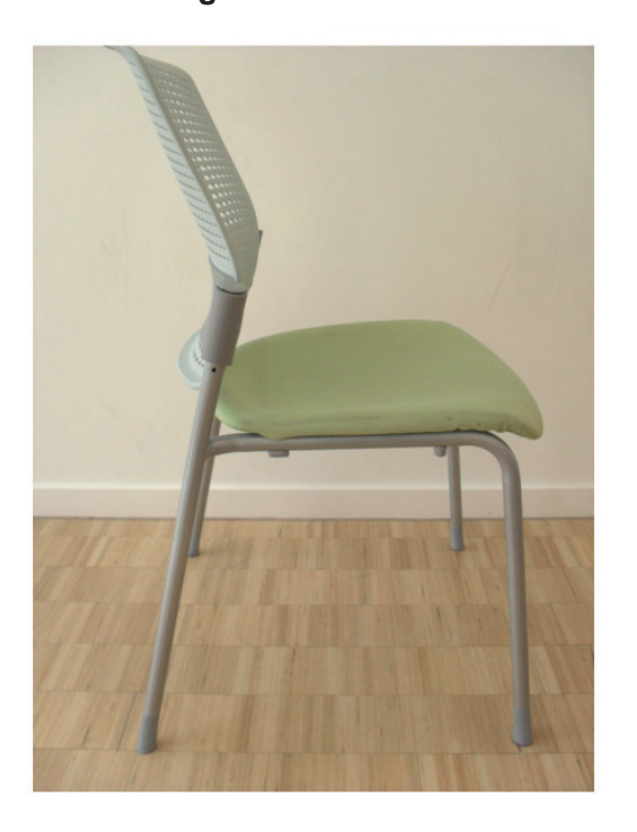
Figure 2 Chair