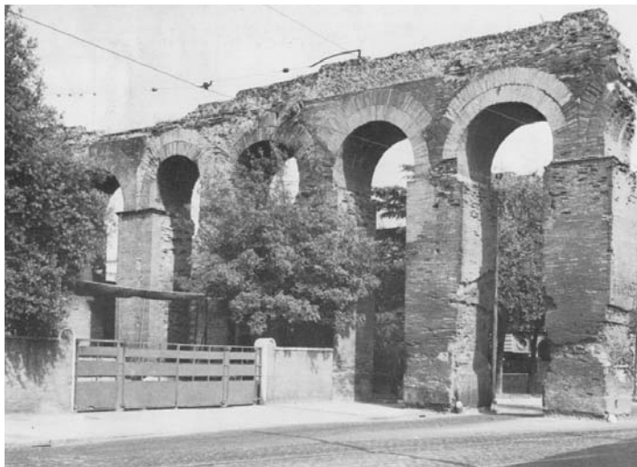
Photograph C Part of the Aqua Julia on the Esquiline Hill in Rome